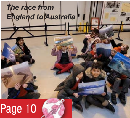
The race from England to Australia