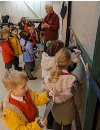
Looking at a timeline of transport.

Year 1 said they had a wonderful day at Shuttleworth and it all started with a coach ride!