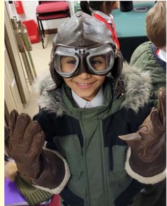
Trying on clothing worn by pilots in the past.