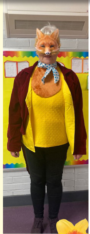
What a fantastic fox!

I hope you all have a lovely Easter break and I look forward to working with you all in the summer term.