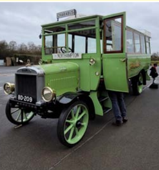
The Vintage Bus!