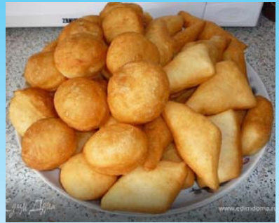
Boursak - fried dough often served with Kazakh chai (tea) or as a dessert.