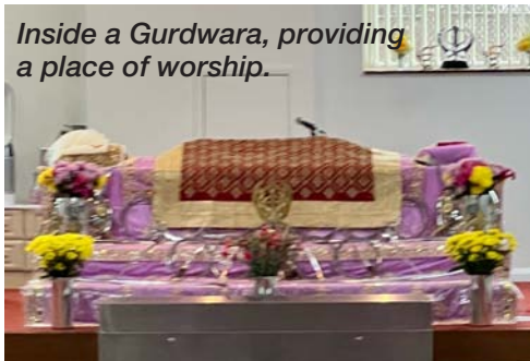
Inside a Gurdwara, providing a place of worship.

The Guru Granth Sahib is treated as a living person and has its own room in the gurdwara. The person who looks after the Guru Granth Sahib is the granthi and he may lead the morning and evening services. However, any Sikh, male or female, who is able to do so, can lead public worship.