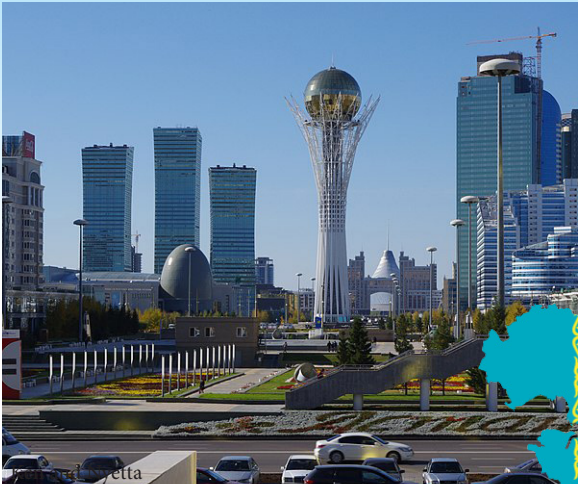
Astana - the capital city.