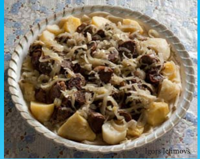
Beshbarmak - finely chopped boiled meat mixed with dough and chyk (an onion sauce)

Kazakhstan is rich in mineral resources and produces lots of uranium, coal, oil and gas. They also own the tallest chimney power station in the world.