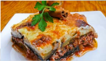
Moussaka - traditional Greek cuisine

The Greeks are very well known for their food and cuisine like olive oil, feta, and Briam - a type of cheese. Here are some of their well-known dishes Souvlaki, Moussaka and Keftedes.